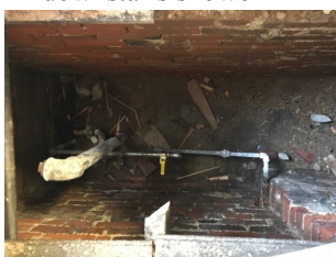
frozen/broken water line